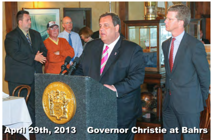
April 29th, 2013 Governor Christie at Bahrs