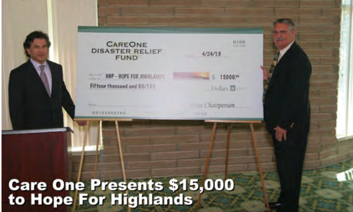
Care One Presents $15,000 to Hope For Highlands