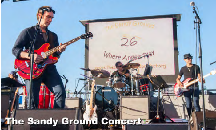
The Sandy Ground Concert