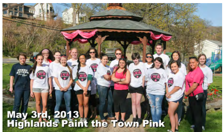
May 3rd, 2013 Highlands Paint the Town Pink