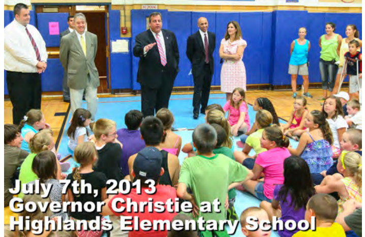
July 7th, 2013 Governor Christie at Highlands Elementary School