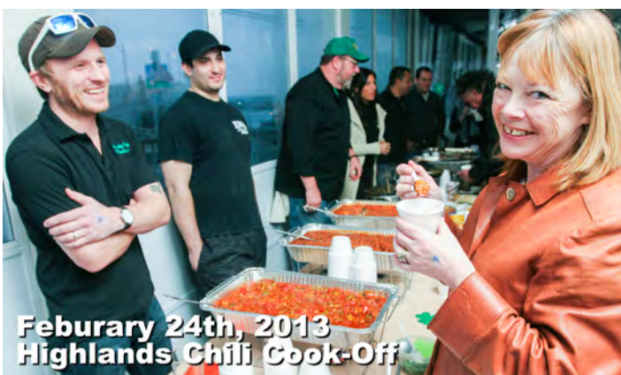
February 24th, 2013 Highlands Chili Cook-Off